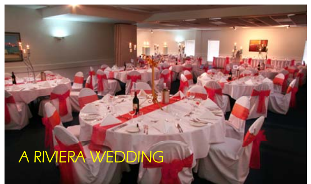
A RIVIERA WEDDING