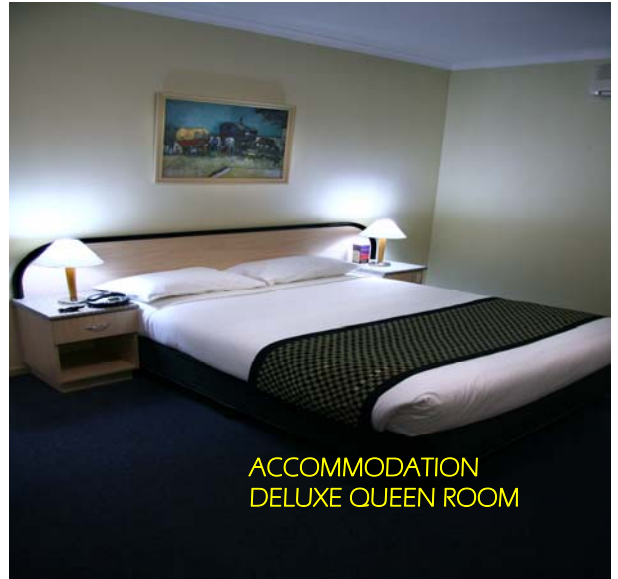
ACCOMMODATION DELUXE QUEEN ROOM